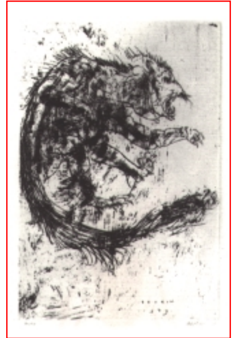
RAMPANT BEAST. Etching. 1970. 45 x 30 cm. (Paper size: 75 x 53 cm.) Printed in black on Vélín d'Arches paper. Edition of 90. Fern & O'Sullivan , no. 559.