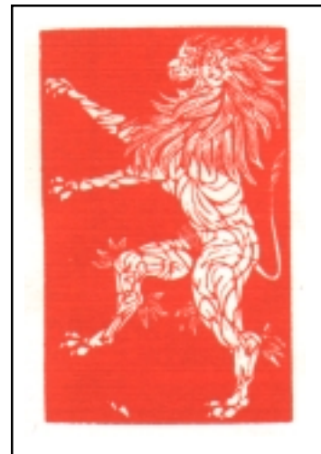
LION. Wood engraving. 1954. 6 x 3.5 cm. (Paper size: 26.9 x 23.5 cm.) Printed in orange on Sekishu paper for the 1958 edition, without the ex-libris text. Fern & O'Sullivan , no. 245.