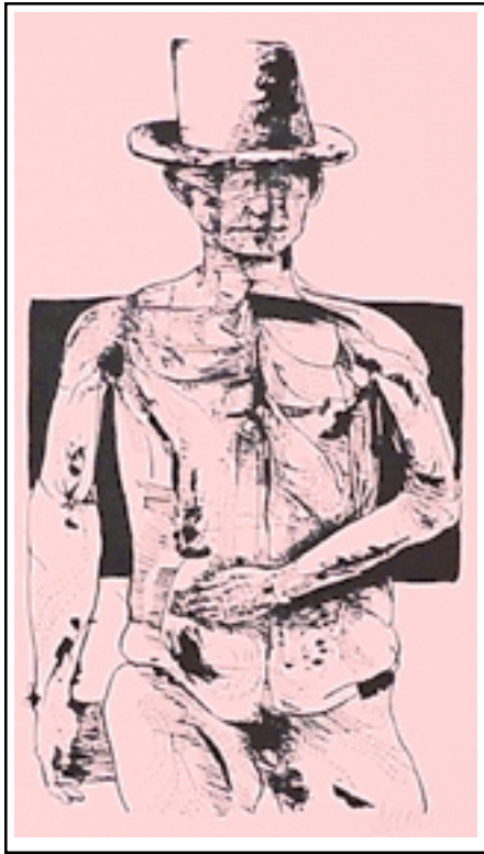
QUEEQUEG. Lithograph. 17 x 11 1/2 in. Printed in black on BFK Rives paper. Edition of 200. (F & O., 574)