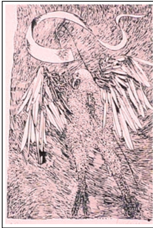
ALBATROSS. Lithograph. 17 x 11 1/2 in. Printed in black on BFK Rives paper. Edition of 200. (F. & O., 569).

Leonard Baskin was born in New Brunswick, NJ in 1922. He lived for many years in Leeds, Massachusetts, and died in 2000. He is a celebrated graphic artist, fine printer and sculptor, and was honored with a one man show at the Library of Congress in 1994.