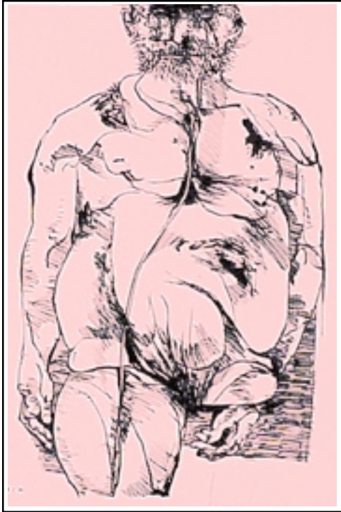
CAPTAIN AHAB. Lithograph. 17 x 11 1/2 in. Printed in black on BFK Rives paper. Edition of 200. (E & O., 571).