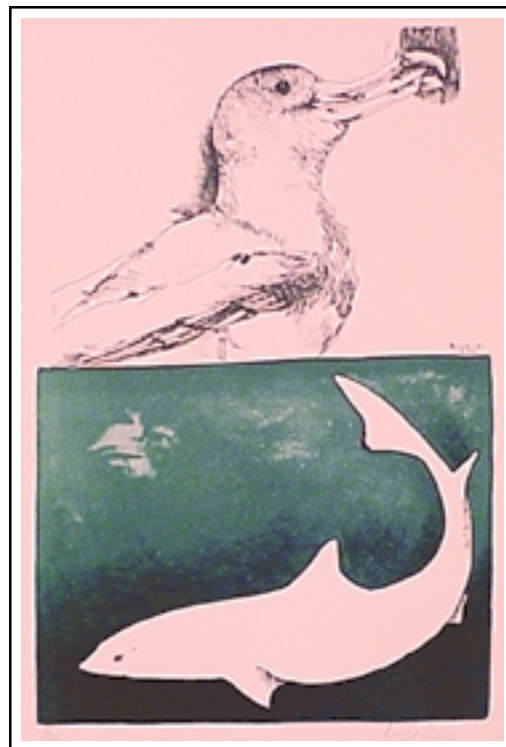
SEAGULL & SHARK. Color lithograph. 17 x 11 1/2 in. Printed in 2 greens and black on BFK Rives paper. Edition of 200. (E & O., 575).