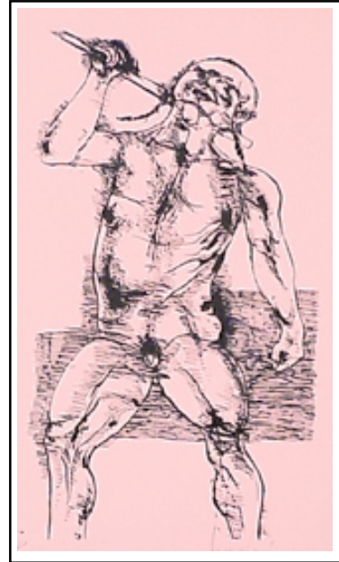
TASHTEGO. Lithograph. 17 x 11 1/2 in. Printed in black on BFK Rives paper. Edition of 200. (F & O., 570).