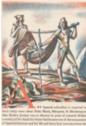
02-0740 The Bridge at San Luis Rey: The Marquesa de Montemayor (Part Two). $50.00 Color lithograph, 1929. One of 1100 impressions on Vidalon. Burne Jones no. 44