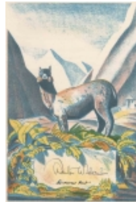
02-0744 The Bridge at San Luis Rey: Signature Page and Colophon Page. $175.00 Color lithograph, 1929. One of 1100 impressions on Vidalon. Burne Jones, no. 48 and no. 49. Signed in ink by Rockwell Kent and Thorton Wilder.