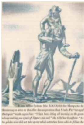
02-0742 The Bridge at San Luis Rey: Uncle Pio (Part Four). $50.00 Color lithograph, 1929. One of 1100 impressions on Vidalon. Burne Jones no. 46