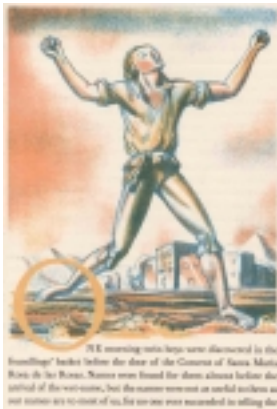
02-0741 The Bridge at San Luis Rey: Esteban (Part Three). $50.00 Color lithograph, 1929. One of 1100 impressions on Vidalon. Burne Jones no. 45