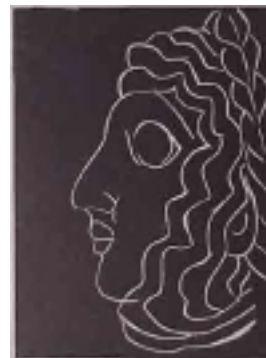
02-0838 Matisse, Henri. $125.00 Classical Man in Profile. Linocut from Pasiphaé, 1981. Designed in 1943. Duthuit, no. 38.