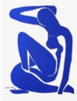
50-0028 Matisse, Henri. $125.00 Blue Nude. Serigraph after Matisse. 26 x 20 inches.