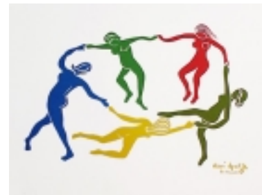
50-0031 Matisse, Henri. $125.00 Women Dancing. Serigraph after Matisse. Four colors. 26 x 19 inches.