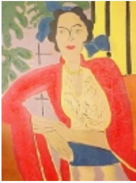
50-1150 Matisse, Henri. $70.00 Seated Woman. Silkscreen print. Raymond & Raymond, Inc.