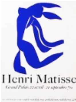
50-0029 Matisse, Henri. $125.00 Dancer - Grand Palais. Serigraph after Matisse. Two colors. 26 x 19 inches.