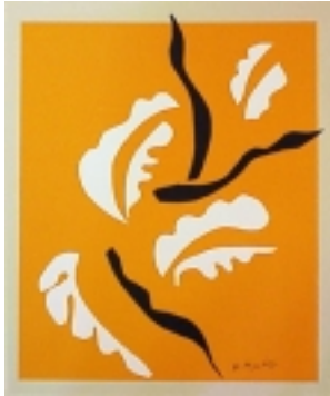
02-0654 Matisse, Henri. $125.00 Danseuse acrobatique. Serigraph after Matisse's 1946 work. Nouvelles Images, Lombreuil, France, 1973. 18.5 x 14.5 inches. Image size. Paper cutout on orange background, gouache découpée