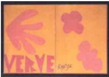
02-0837 Matisse, Henri. $225.00 Cover for Verve. Cover for Verve 35/36. summer, 1958. Framed. Duthuit, no. 139.