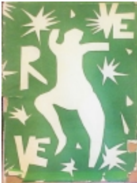
02-0003 Matisse, Henri. $150.00 De la Couleur. Verve, vo. IV, No. 13. Editions de la revue Verve. 1945. Lacking the frontispiece (la Chute d'icare). Green cover of dancing figure (worn and torn) and title page are silkscreens designed by Matisse. Portraits on Marais paper. Duthuit