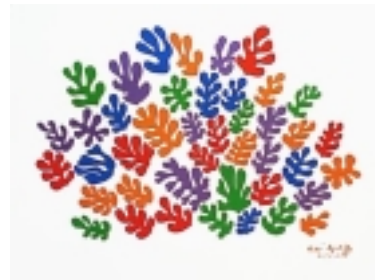
02-0652 Matisse, Henri. $150.00 Flower Petals. Serigraph after Matisse's paper cutout . 20 x 26 inches. Image size.