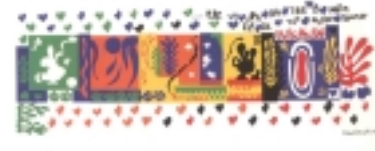
50-0032 Matisse, Henri. $250.00 Elle vit apparaître le matin. Serigraph after Matisse. Five colors. 16 x 36 inches