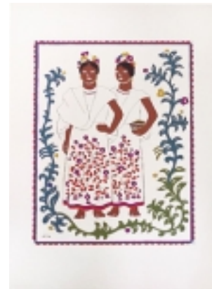
99-0050 Papantla del Estado de Veracruz. $175.00 Serigraph in colors 45 x 33 cm. (17-3/4 x 13 inches). From Trajes Regionales Mexicanos. Mexico, D.F., Editorial Atlante, [1945]. Signed in the Plate. Before lettering of title.