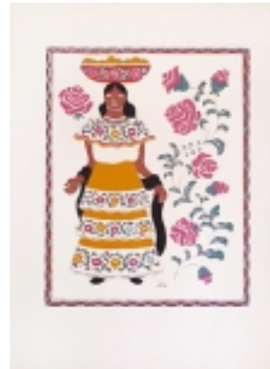
99-0041 Mestiza de Chiapas. $175.00 Serigraph in colors 45 x 33 cm. (17-3/4 x 13 inches). From Trajes Regionales Mexicanos. Mexico, D.F., Editorial Atlante, [1945]. Signed in the Plate. Before lettering of title.