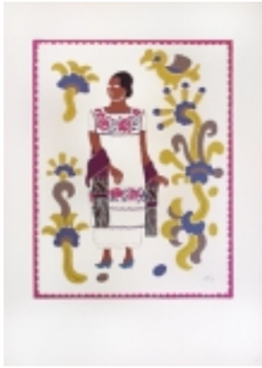
99-0051 Mestiza del Estado de Yucatán. $175.00 Serigraph in colors 45 x 33 cm. (17-3/4 x 13 inches). From Trajes Regionales Mexicanos. Mexico, D.F., Editorial Atlante, [1945]. Signed in the Plate. Before lettering of title.