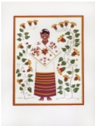
99-0048 Huasteca del Estado de San Luis Potosí. $175.00 Serigraph in colors 45 x 33 cm. (17-3/4 x 13 inches). From Trajes Regionales Mexicanos. Mexico, D.F., Editorial Atlante, [1945]. Signed in the Plate. Before lettering of title.