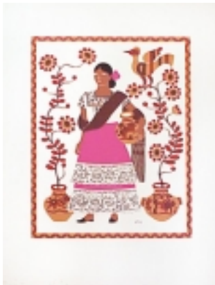
99-0037 Mestiza de Campeche. $175.00 Serigraph in colors 45 x 33 cm. (17-3/4 x 13 inches). From Trajes Regionales Mexicanos. Mexico, D.F., Editorial Atlante, [1945]. Signed in the Plate. Before lettering of title.