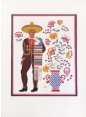
99-0038 Charro y Sarape de Saltillo de Coahuila. $175.00 Serigraph in colors 45 x 33 cm. (17-3/4 x 13 inches). From Trajes Regionales Mexicanos. Mexico, D.F., Editorial Atlante, [1945]. Signed in the Plate. Before lettering of title.