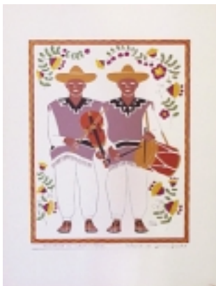
99-0042 Músicos de Atotonilco de Guanajuato. $175.00 Serigraph in colors 45 x 33 cm. (17-3/4 x 13 inches). From Trajes Regionales Mexicanos. Mexico, D.F., Editorial Atlante, [1945]. Signed in the Plate.