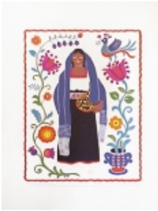
99-0043 Purépecha del Estado de Michoacán. $175.00 Serigraph in colors 45 x 33 cm. (17-3/4 x 13 inches). From Trajes Regionales Mexicanos. Mexico, D.F., Editorial Atlante, [1945]. Signed in the Plate.