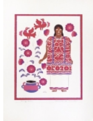
99-0045 Mazateca del Estado de Oaxaca. $175.00 Serigraph in colors 45 x 33 cm. (17-3/4 x 13 inches). From Trajes Regionales Mexicanos. Mexico, D.F., Editorial Atlante, [1945]. Signed in the Plate.