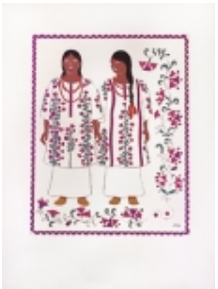
99-0049 Zongolica del Estado de Veracruz. $175.00 Serigraph in colors 45 x 33 cm. (17-3/4 x 13 inches). From Trajes Regionales Mexicanos. Mexico, D.F., Editorial Atlante, [1945]. Signed in the Plate. Before lettering of title.