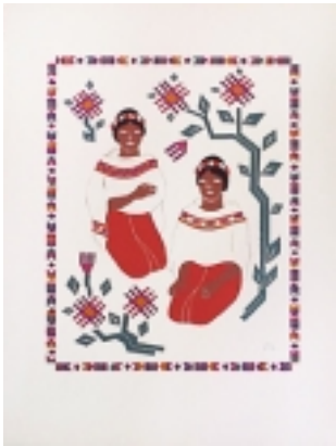
99-0040 Tetzales de Chiapas. $175.00 Serigraph in colors 45 x 33 cm. (17-3/4 x 13 inches). From Trajes Regionales Mexicanos. Mexico, D.F., Editorial Atlante, [1945]. Signed in the Plate. Before lettering of title.