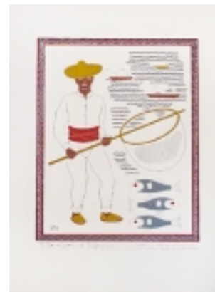
99-0044 Pescadores de Pátzcuaro del Estado de Michoacán. $175.00 Serigraph in colors 45 x 33 cm. (17-3/4 x 13 inches). From Trajes Regionales Mexicanos. Mexico, D.F., Editorial Atlante, [1945]. Signed in the Plate.