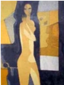
50-0429 Minaux, André. $400.00 Ingénue (Nude). New York: Kennedy Graphics, 1969. Alan Wofsy Fine Arts, distribution. Lithograph. Printed in six colors on Vélin d'Arches paper. Image size: 11.8 x 9 inches, Paper size: 21.5 x 16 inches. Edition of 95. Hand signed and numbered