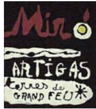
027-8 Bernier, Rosamond and Miró, Joan. $250.00 Sculpture in Ceramic by Miró and Artigas. New York: Pierre Matisse Gallery, 1956. Wittenborn Art Books, distribution. With two original lithographs by Joan Miró: Cover and fold-out plate. Wraps. 28 pp. Cramer, no. 38. Mourlot, nos. 171 and 172.