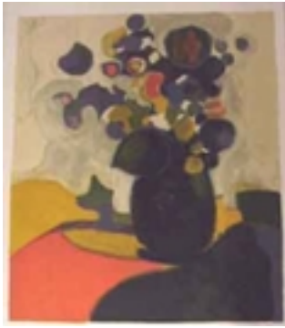
50-0427 Minaux, André. $525.00 Bouquet (Pour Fernand Mourlot). New York: Kennedy Graphics, 1969. Alan Wofsy Fine Arts, distribution. Lithograph. Printed in seven colors on BFK Rives paper. Image size: 22 x 18.8 inches, Paper size: 26 x 20 inches. Edition of 100. Handsigned and numbered by the artist.