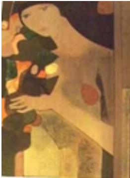
50-0428 Minaux, André. $550.00 Femme aux Fleurs (Cariatide). New York: Kennedy Graphics, 1969. Alan Wofsy Fine Arts, distribution. Lithograph. Printed in eight colors on Vélin d'Arches paper. Image size: 25.5 x 19.6 inches, paper size: 29.9 x 22.5 inches. Edition of 125. Hand signed and