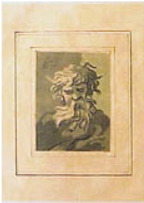
02-0183 Head of an Old Man with a Beard.

$1875.00 Woodcut after Raphael. 1783. Four blocks: light green, medium green, dark green, very dark green. 213 x 280 mm. Nagler, 4. Le Blanc, 4. Kennedy, 165.