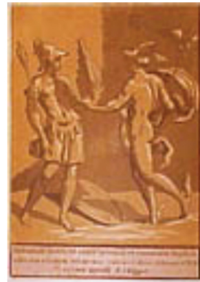
02-0193 Mercury Speaking to a Warrior.

$1250.00 Woodcut after Raphael. Two blocks: olive green and dark gray. 168 x 80 mm. Nagler, 22. Le Blanc, 22. Kennedy, 176. Printed on a single sheet with Caryatid.