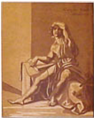
02-0202 Seated Young Man. $1750.00 Woodcut after Michelangelo. Three blocks: tan, medium brown, dark brown. 198 x 154 mm. initialled and dated 1783.