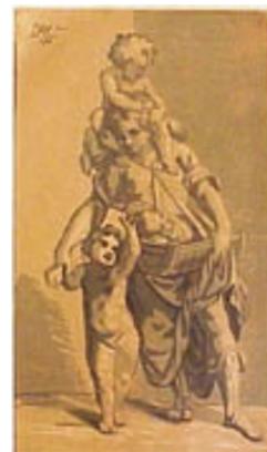
02-0199 Charity with Three Children.

$2000.00 Woodcut. Four plates: light green, light brown, medium brown, dark brown. 242 x 207 mm. Initialled and dated 1782. Nagler, 5. Le Blanc, 5. Kennedy, 183.