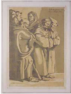
02-0198 A Group of Monks.

$1750.00 Woodcut After Peter Paul Rubens. Four blocks: tan, light brown, dark brown, darker brown. 379 x 232 mm. Kennedy, 175. Nagler, 13. Le Blanc, 13.