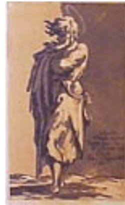
02-0189 Man holding Mantle, with Aureole.

$1750.00 Woodcut. Four blocks, light green, olive green, dark olive green and olive-black. 136 x 102 mm. 1751. Kennedy, 158.