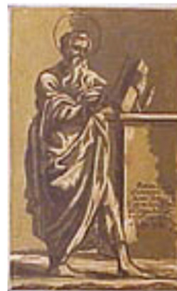
02-0187 St. Paul Reading a Book. $1750.00 Woodcut after P. del Vaga. Three color blocks, tan, brown and dark brown. 235 x 140 mm. Signed and dated 1782. Nagler, 19. Le Blanc, 19. Kennedy, 180.