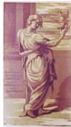
02-0190 St. John holding a Chalice. $1875.00 Woodcut after Parmigiano. Four blocks: light green, light brown, medium brown, dark brown. 282 x 154 mm. Signed in the block. Nagler, 17. Le Blanc, 17. Kennedy, 191.