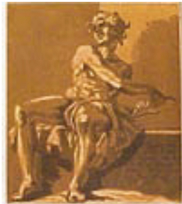
02-0195 Seated Young Man with a Book. $1750.00 Woodcut after Giorgione. Three blocks: tan, medium brown, dark brown. 186 x 161 mm. 1783. Nagler, 23. Le Blanc, 23. Kennedy, 157.