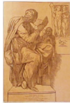
02-0203 A Sibyl Reading, with Four Children. $1875.00 Woodcut after Michelangelo. One line block, brown, on tan paper. 385 x 250 mm. 1782. Nagler, 14. Le Blanc, 14. Kennedy, 167.