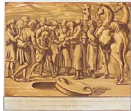
02-0200 Joseph Sold by his Brothers.

$1750.00 Woodcut After Peter Paul Rubens. Four blocks: tan, light brown, dark brown, darker brown. 379 x 232 mm. Kennedy, 175. Nagler, 13. Le Blanc, 13.