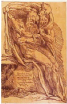
02-0197 Naked Man being Wrapped in a Mantle. $1750.00 Woodcut after Baccio Bandinelli. 1782. Brown line on tan paper. 390 x 255 mm. Nagler, 27 Le Blanc, 27. Kennedy, 168.