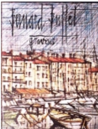
046-1 Buffet. Complete Engravings, 1948-1980.

$350.00 Vol. II. Catalogue raisonné. Paris, 1987. With 190 color illustrations and 3 original color lithographs, including the dust jacket. Cloth. 264 pp. English and French. 24 x 32 cm. (ISBN 1-55660-047-X).