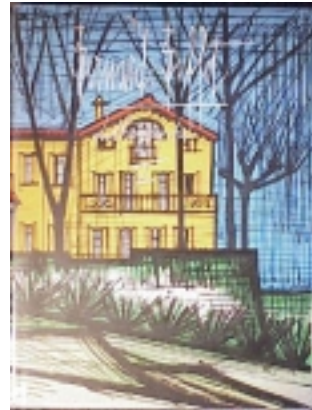
047-X Buffet. Lithographs, 1979-1986.

$850.00 Catalogue raisonné. Paris & New York, 1968. With 66 color illustrations and 11 original lithographs. Cloth. 180 pp. French and English. 24.2 x 32.3 cm. (ISBN 1-55660-047-3).