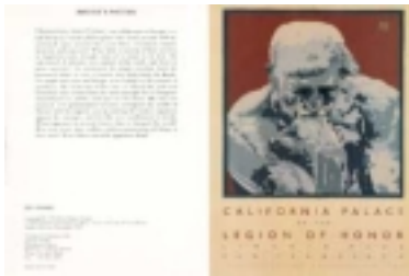
03-0221 Goines, David Lance. $10.00 California Palace of the Legion of Honor. (Rodin's Thinker). 12 notecards. 1995. 7 x 10 inches (unfolded). Goines, 165.