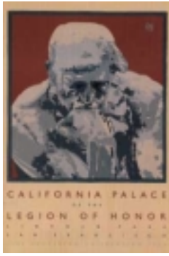
03-0217 Goines, David Lance. $10.00 California Palace of the Legion of Honor. (Rodin's Thinker). 12 postcards. 1995. 6 x 4 inches. Goines, 165.