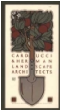
03-0215 Goines, David Lance. $10.00 Carducci & Herman. Landscape Architects. 12 poster cards. 1997. 6 x 3.5 inches. Goines, 93.