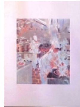
01-0146 Plaza Athénée. $35.00 Menu. Plaza Athénée, Paris. 6 page lunch menu with color view of kitchen. 1966.