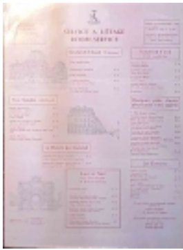
01-0157 Hotel Meurice. $25.00 Menu. Hotel Meurice, Paris. 2 page room service menu.