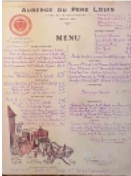
01-0158 Auberge du Père Louis. $35.00 Menu.