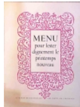
01-0147 L'Oustau de Baumanière. $45.00 Menu. L'Oustau de Baumanière, Les Baux- en-Provence. "Menu pour fester dignement le printemps nouveau." Circa 1960s. finely printed on Arches. time stain lower left.