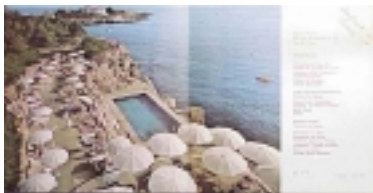
01-0144 Eden Roc. $35.00 Menu. Eden Roc, Cap d'Antibes. 4 page lunch menu with color view. 1972.