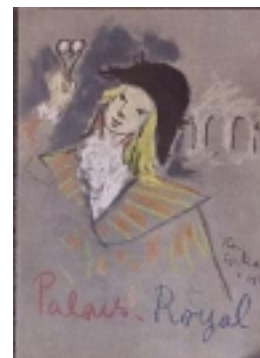
01-0159 Grand Véfour. $70.00 Menu.

Lucas Carton, Place de la Madeleine, Paris. 1page menu . Folio. 1960. View of the Place from 1900 by L. Pénat.. Rag paper.