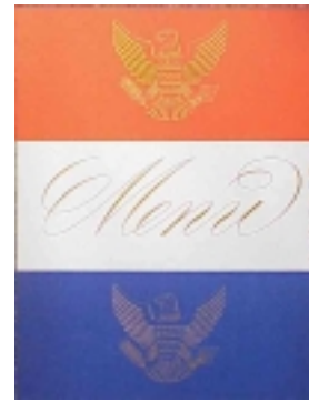
01-0145 United States Lines. $35.00 Menu. S.S. United States. Menu. Luncheon. June 4., 1957. Red, white and blue with eagles on front cover.