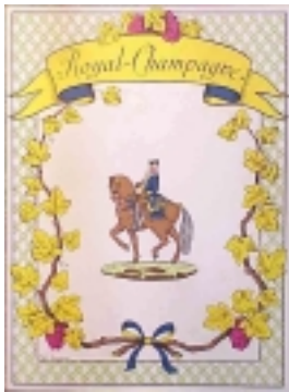
01-0143 Royal-Champagne. $35.00 Menu. 4 page menu with pictorial cover by Robert Dameron. Chapillon, Marnes. circa 1960.