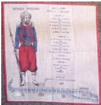
01-0161 Bateaux Mouches. $60.00 Menu.

Le Coq Hardi, Paris. 8 page menu (3 blank) with color drawing on cover by Carzou. Circa 1979. Chef de Cuisine: Joël Verron. Printed by Draeger.