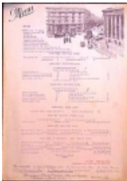
01-0153 Lucas Carton. $45.00 Menu.

Eden Roc, Cap d'Antibes. 4 page lunch menu with color view and Pan American plane on covers. 1972.