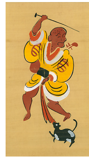
Blind Man and Dog ( Zato ), Otsu-e, ink and colors on paper scroll, 38 x 25 cm (15 x 10 inches), Paper size: 72 x 25 cm, Early-Mid 20 th century.