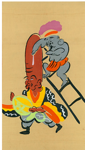
Daikoku Shaving Fukurokuju on a Ladder ( Geho no hashigozori ), Otsu-e, ink and colors on paper scroll, 33 x 25 cm (13 x 10 inches), Paper size: 72 x 25 cm, Early-Mid 20 th century.