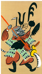
Benkei with Seven Weapons ( Naginata Benkei ), Otsu-e, ink and colors on paper scroll, 43 x 25 cm (17 x 10 inches), Paper size: 72 x 25 cm, Early-Mid 20 th century.