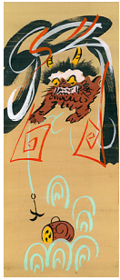
Thunder God and Drum ( Kaminari to taiko ), Otsu-e, ink and colors on paper scroll, 59 x 25 cm (23 x 10 inches), Paper size: 72 x 25 cm, Early-Mid 20 th century.

Gods and Goblins. Japanese Folk Paintings from Otsu. By Meher McArthur. Pasadena: Pacific Asia Museum, 1999. This useful monograph and the original paintings depicted on this page are available from: www.art-books.com