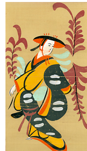
Wisteria Maiden ( Fuji musume ), Otsu-e, ink and colors on paper scroll, 43 x 25 cm (17 x 10 inches), Paper size: 72 x 25 cm, Early-Mid 20 th century.