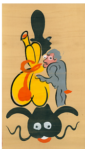
Monkey Trying to Catch a Catfish with a Gourd ( Hyotan namazu ), Otsu-e, ink and colors on paper scroll, 43 x 25 cm (17 x 10 inches), Paper size: 72 x 25 cm, Early-Mid 20 th century.