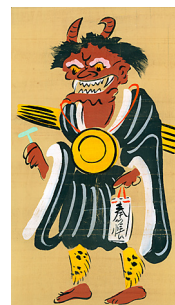
Praying Goblin ( Oni no nenbutsu ), Otsu-e, ink and colors on paper scroll, 43 x 24 cm (17 x 10 inches), Paper size: 72 x 25 cm, Early-Mid 20 th century.