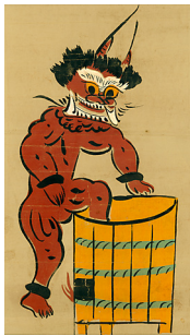
Goblin Taking a Bath ( Oni no gyozei ), Otsu-e, ink and colors on paper scroll, 43 x 24 cm (17 x 10 inches), Paper size: 72 x 25 cm, Early-Mid 20 th century.