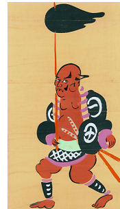
Spear Bearer ( Yarimochi yakko ), Otsu-e, ink and colors on paper scroll, 43 x 25 cm (17 x 10 inches), Paper size: 72 x 25 cm, Early-Mid 20 th century.